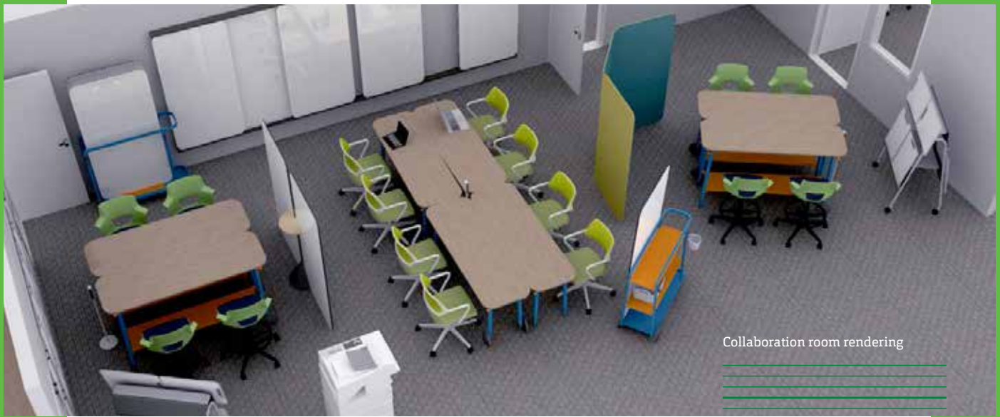
Collaboration room rendering